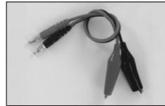
Crocodile clip charging cable 5201-0031-01