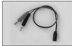
Futaba RX charging cable 5201-0044-01