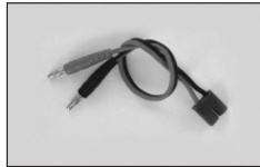
EC3 charging cable 5201-0034-01