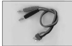
Dean charging cable 5201-0012-01