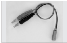
JST/BEC charging cable 5201-0043-01